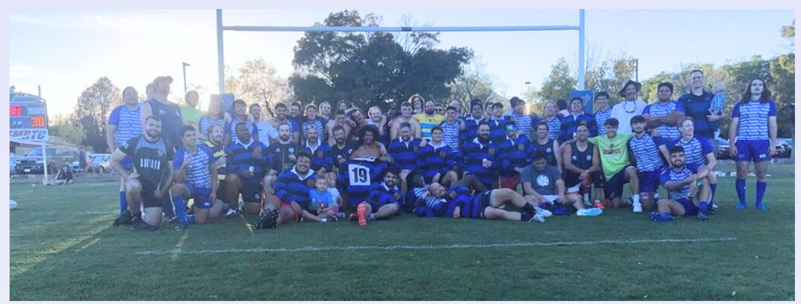
Black and Blue game group photo

New Mexico Tech's umpteenth Annual 49er Black & Blue match on Friday the 13th of October, 2023 ended in a 38-36 victory for the alumni team, reversing a recent string of student victories including 2022's 36-24 score. The result could be seen as a fitting bow by the students to those who helped make New Mexico Tech Rugby what it is after five decades.